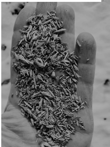
The seed began melting into the snow about 15 minutes after being spread.